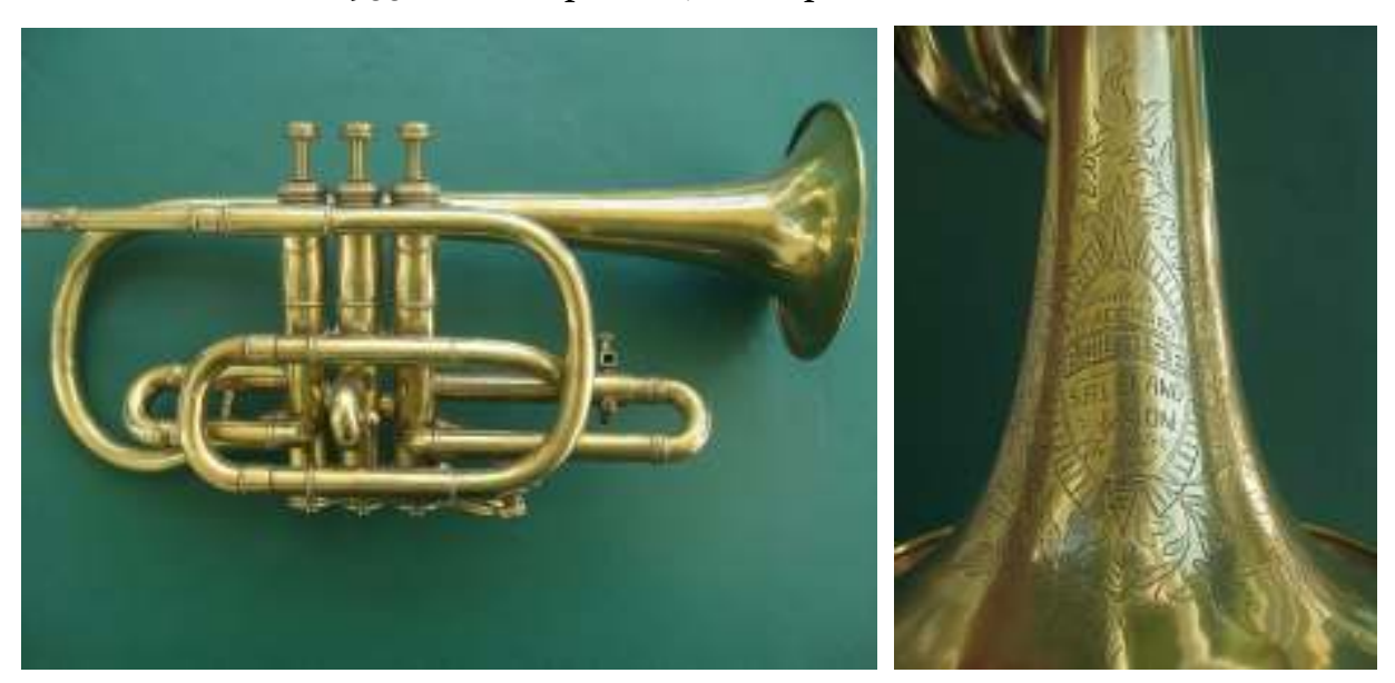
#978; the highest number found so far; similar to the Rex model but the only fixed lead pipe model found; the serial number has moved to the bell engraving

#955; a rare plain brass finish