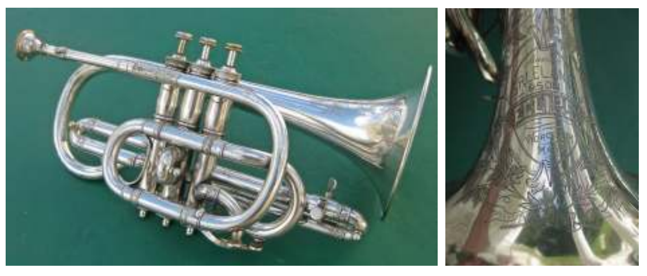
#760 (author's photos); the only Rex model I have seen