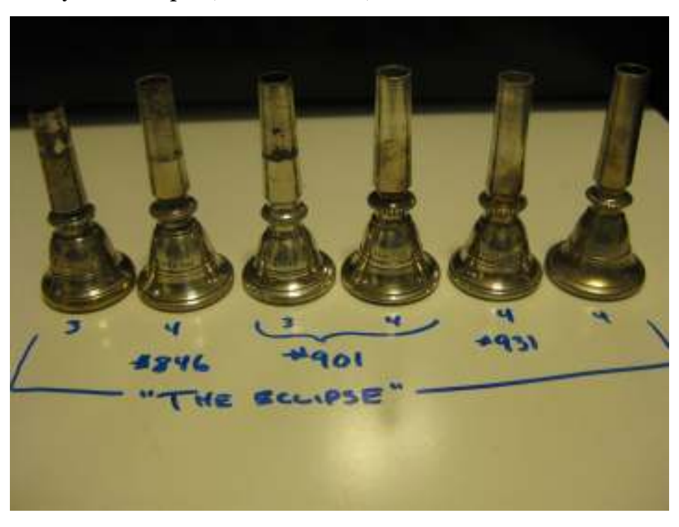
Lyon & Healy catalog page showing the Eclipse model

Others say "The Eclipse", have numbers, and came with the cornets shown