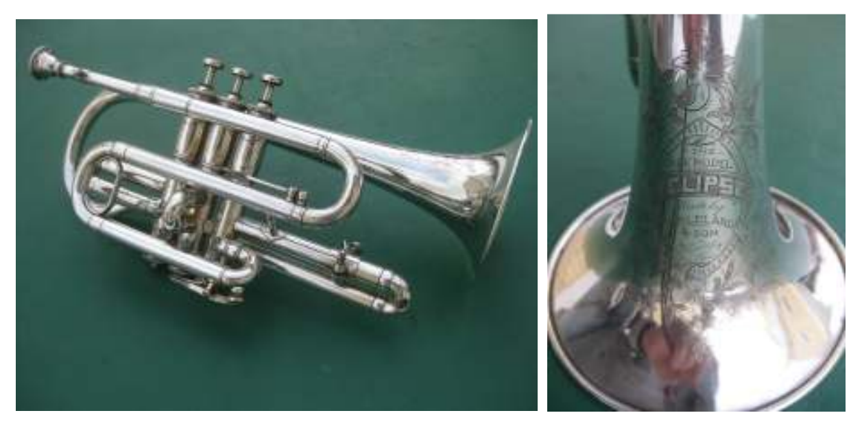
#807 (author's photos); only Simplex model found